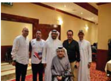
12th Faiza International Para Powerlifting Dubai